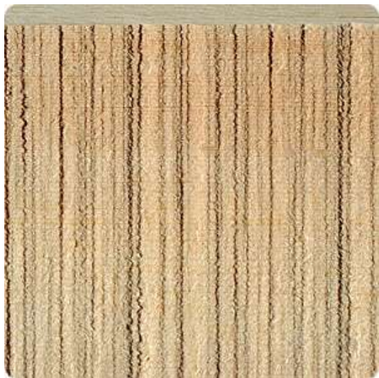
This surface shows the texture and pattern produced by the saw mill. This rough look is suitable for almost any application in a rustic style structure.