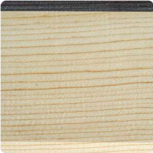
Large belt sanders are used to sand the wood to a uniform, even surface.