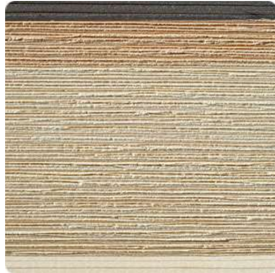
As the name implies, a wire brush is scrubbed along the grain to accentuate it and give the wood a distinct rustic texture.