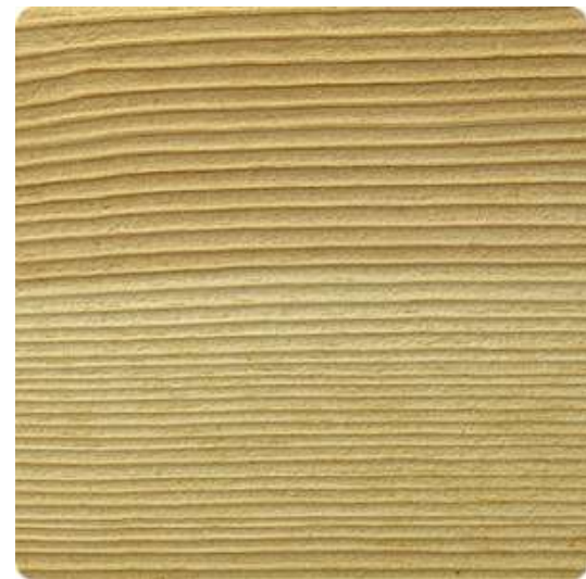
Sand Blasting is the process of spraying the wood with fine sand under air pressure. The sand chips away at the softer portions of the wood, leaving a weathered look similar to prolonged exposure to the elements, but without the detrimental effects.